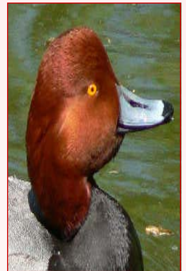
A Red headed Duck

Remember your pet depends on you for protection