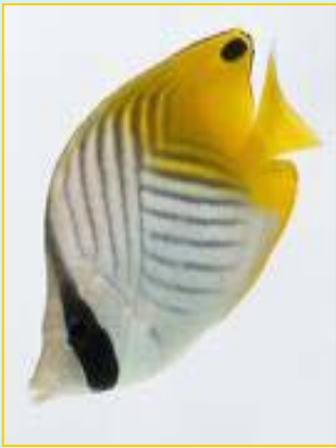
A butterfly fish