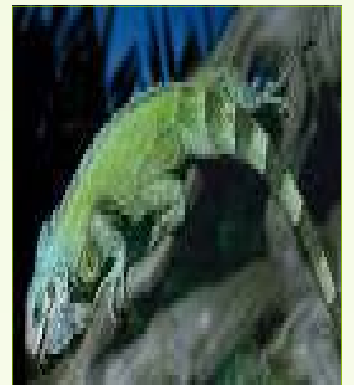
A green iguana