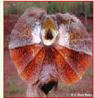
A frilled lizard

Protect your pet birds from Teflon so that you can live together happily for years and years. Your birds will thank you!