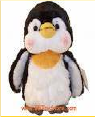
A Stuffed Penguin

If you can donate time or money to a no kill dog or cat shelter