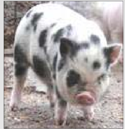
Pot Belly Pig

Vacationing with you pet can be a great experience! There are hundreds of hotels across the country that allow pets. Each hotel, whether independent or part of a chain, has its own policy. Once you figure out your destination, research the hotels in the area to find the right fit. More than likely, you will find fees associated with having your pet, but it is worth it to have the extra company!