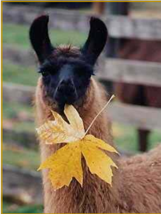
Llama eating a leaf