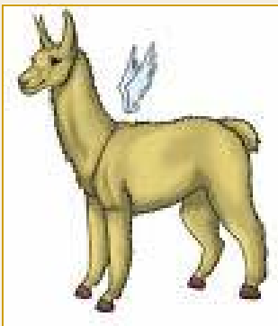
Virtual pet Wooley Hooves

If you can donate time or money to a no kill dog or cat shelter