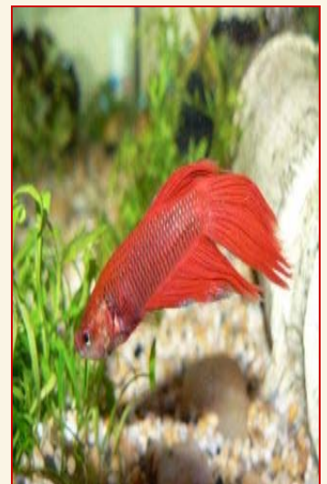
A Pork fish