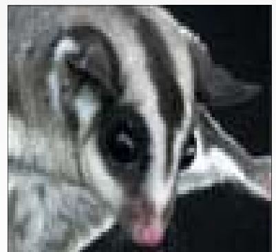
A Sugar Glider