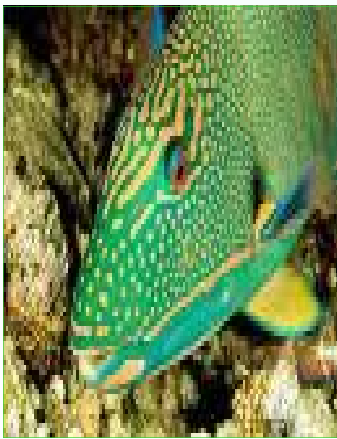
A bicolor parrot fish